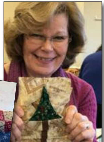
We LOVE Quilt-In!

IMPORTANT: The March IQI meeting and workshops will be held at Gloria Dei !