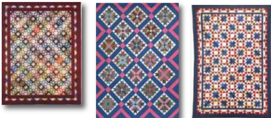
From left: Tillie’s Treasures Prairie Gems Star & Crown (See her website for other Small Wonder quilts).

Oct 6 Small Wonders —8 quilts to choose from featuring: Tillie’s Treasures, All That Glitters, Butterfly Waltz, Star and Hourglass and more! Once you start with these units you won’t want to stop. Simple sewing and cutting techniques will turn your 5” squares into these remarkable units without cutting any triangles or working with bias.