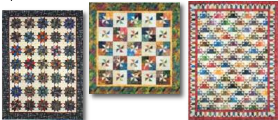
From left: Millennium Star Pinwheels on Parade Dawn to Dusk (See her website for other Picket Fence quilts).

Oct 7 Picket Fence —5 Quilts to choose from. The picket fence unit is made with the sew & flip method. No triangles to cut or bias to work with. Pat will have handouts with design variations and how to make your pieced border fit your top.