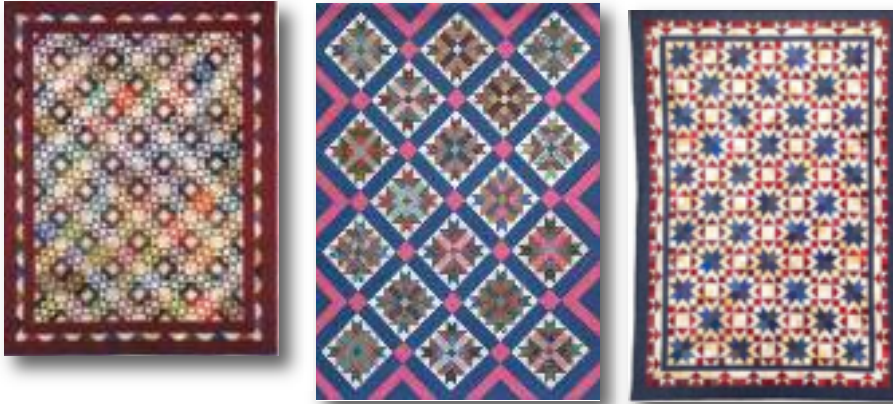
From left: Tillie’s Treasures Prairie Gems Star & Crown (See her website for other Small Wonder quilts).

Oct 6 Small Wonders —8 quilts to choose from featuring: Tillie’s Treasures, All That Glitters, Butterfly Waltz, Star and Hourglass and more! Once you start with these units you won’t want to stop. Simple sewing and cutting techniques will turn your 5” squares into these remarkable units without cutting any triangles or working with bias.