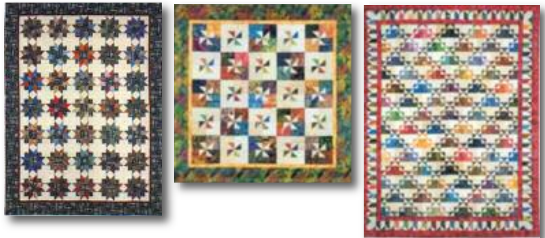
From left: Millennium Star Pinwheels on Parade Dawn to Dusk (See her website for other Picket Fence quilts).

Oct 7 Picket Fence —5 Quilts to choose from. The picket fence unit is made with the sew & flip method. No triangles to cut or bias to work with. Pat will have handouts with design variations and how to make your pieced border fit your top.