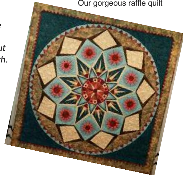
Our gorgeous raffle quilt