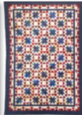
From left: Tillie's Treasures Prairie Gems Star & Crown (See her website for other Small Wonder quilts).