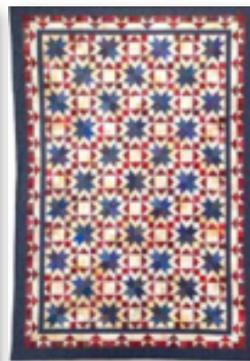
From left: Tillie's Treasures Prairie Gems Star & Crown (See her website for other Small Wonder quilts).